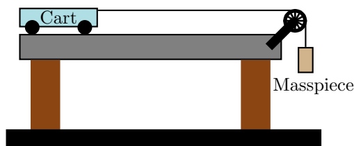
Figure 2: Cart and suspended masspiece.

In this experiment, you will consider energy conservation for the system illustrated in Fig. 2. The cart and suspended masspiece will be released from rest and allowed to accelerate until the suspended masspiece hits the floor. The task will be to determine the change in total energy from the moment of release (the initial moment) to the moment just before the suspended masspiece hits the floor (the final moment).